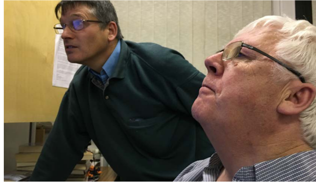
..."I told you the monitor was at the wrong angle"